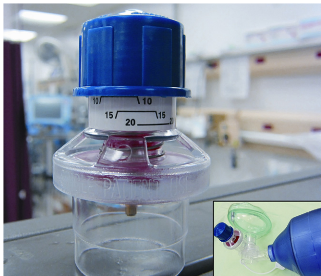
Figure 2. A disposable PEEP valve. This inexpensive item is a strain gauge capable of PEEP settings from 5 to 20 cm H 2 O. When placed on the exhalation port of a bag-valve-mask device (inset), it allows the device to provide PEEP/CPAP when the patient is spontaneously breathing and during assisted ventilations. If combined with a nasal cannula set to 15 L/minute, it will provide CPAP even without ventilations. The generation of positive pressure is predicated on a tight mask seal.

effects may not be applicable to volume-depleted critically ill patients. 36